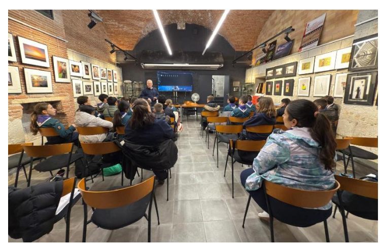
Youth Arts lamboree. Scouts

The Society is fully engaged with Gibraltar Cultural Services and often cooperate with them in exhibitions and competitions where photography is widely accepted as part of the cultural/art scene in Gibraltar. We run induction courses in photography that are open to the public, and we also participate in a summer programme for children run by the Gibraltar Sports and Leisure Authority. Here we run practical photography workshops for