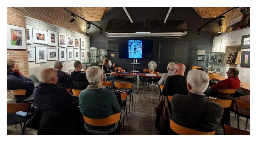
Talk on a trip to India

We meet every Monday evening from around 7.00pm 9.00pm, and our programme follows that of many UK clubs: regular competitions in Black and White Prints, Colour Prints, and Digital Images. These are on themes set at the start of the season. We also hold talks and presentations on all aspects of photography, but we have a problem that we