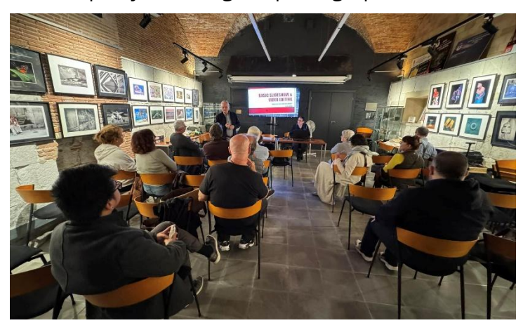
Talk on creating slideshows

having a photography awareness stand in the centre of town, special articles in the local press, and hopefully a dedicated programme on local TV. All this will serve to put the Society in the spotlight and provide it with plenty of publicity. Hopefully we can attract more members, especially among the young. We are happy that we provide a good range of activities during the year, and that the membership is generally satisfied with what we offer. However,