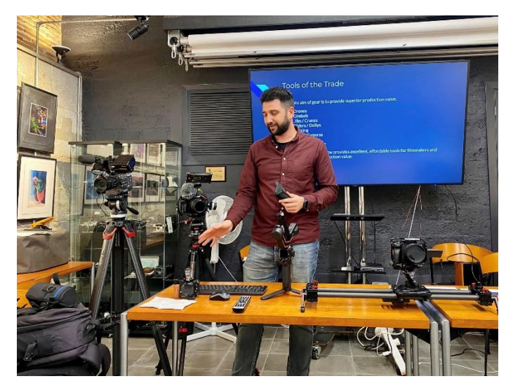
Talk by GBC cameraman

there is always room for improvement. We would like to offer a greater range of workshops, including some aimed at developing the skills of beginners, especially in the use of