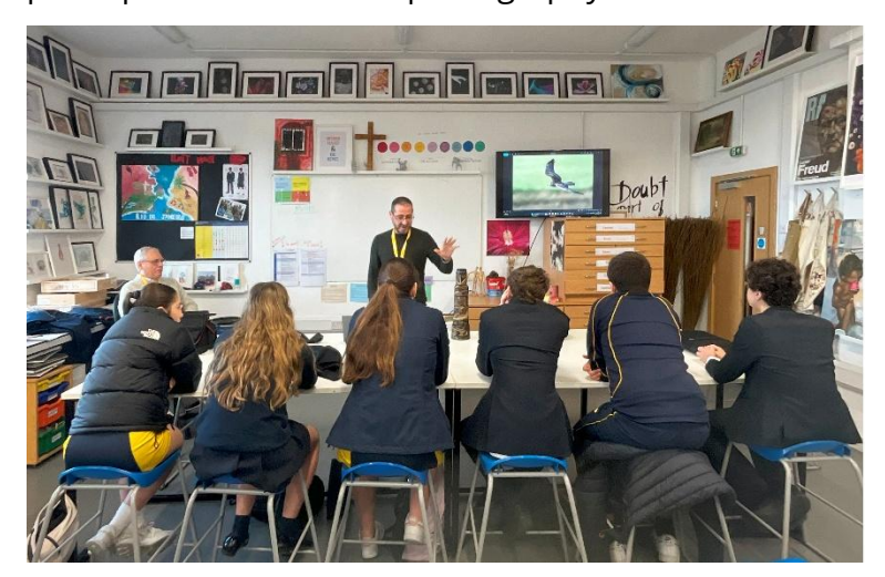
Talk to GCSE students

children between 10 and 12 during their summer holidays. We also carry out workshops for children with special needs. We provide assessors for the Duke of Edinburgh Award participants who choose photography as their skill and run workshops for scouts who wish to