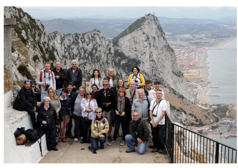
GPS outing to O'Hara's Battery

accessories, and these are used to hold studio sessions with models. Members can hire the premises and equipment at a small fee. We organise outings Gibraltar and around neighbouring Spain, and also across the Strait of Gibraltar to Morocco. A popular destination is the beautiful blue village of Chefchaouen in Morocco. Outings to the Carnival in Cadiz are also popular. We hold "You are the Appraiser" sessions where members are asked to appraise a