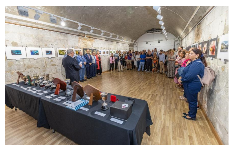
Club members at the Annual Exhibition opening

Our membership currently stands at 60, which is not bad going for a territory whose population is only 30,000! This number tends to vary from year to year, with it reaching 90 in strong years. Membership is open to anyone interested in photography, and we accept membership from around 12 years of age. Originally most members were men, but today 34% of members are women. We attract members via Facebook